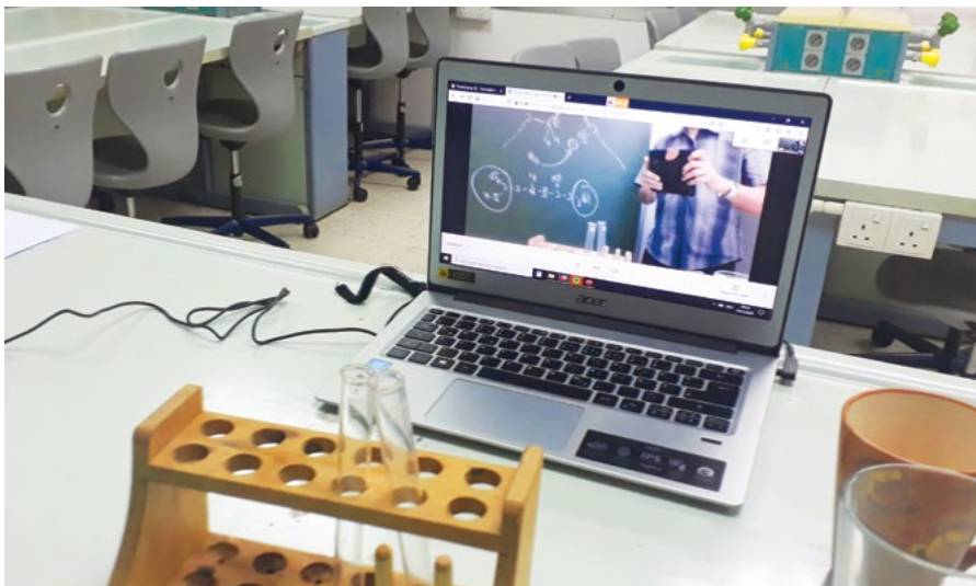
Chemistry lessons without students.

A t DSKL, we are utilising established educational online learning platforms such as Google Classroom, Google Meet, Anton APP and SeeSaw. In preparation for a possible school-closure, staff had been trained in the use of these platforms and for all classes and subjects, digital classrooms were created. This allows students and staff to meet virtually/online and teachers will generally be available during normal school hours. These online platforms support off-campus learning as well as collaboration to ensure a quality student learning experience.