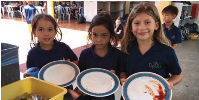
Students from DSKL showing their clean plates. Well done, girls!

In the West, around 4.4 million tonnes of food products are discarded each year. This amount of food would be sufficient to feed 8 million people a year. Recently, the student representatives of the German School Kuala Lumpur (DSKL), decided to act on this.